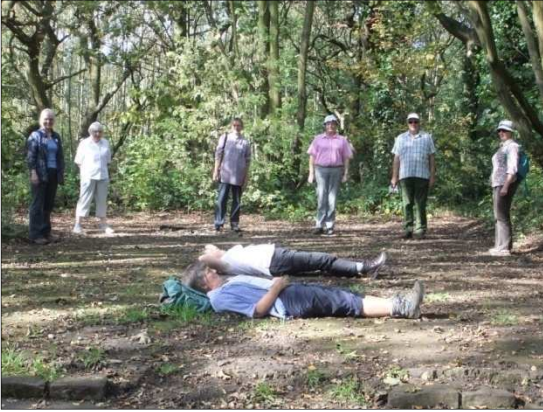
Rest area of the former Open Air School