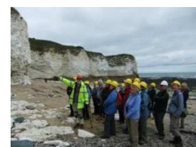
Calendar cover picture