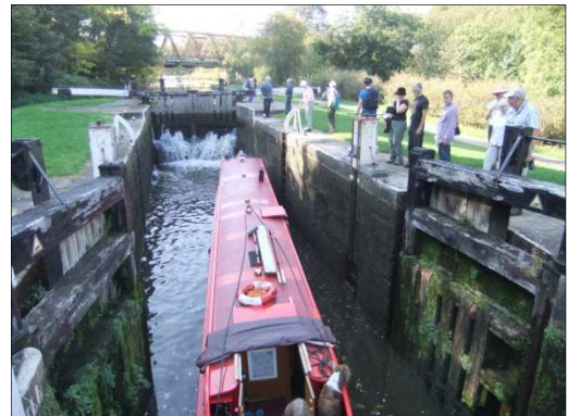
Watching a boat ascend the lock

The path led down to the Leeds and Liverpool Canal, a feat of engineering that was initiated by the desire of Bradford and other local businessmen to get much needed limestone from the Skipton area. The first stretch from Skipton to Bingley was opened in 1773, and the stretch to Field Lock in Thackley in 1774. Leeds was connected by 1777, but the whole length to Liverpool was not completed until 1816. Field Lock marks the boundary of Buck Wood and Field Wood, and also represents an early style of lock construction. The right-angled kerbs of the entrance to the lock had to be modified with wooden guidance posts because boats were damaged against the sharp edges as they manoeuvred into the lock. Walking back along the towpath towards the site of Buck Mill swing-bridge, there were views of some of the fields within the wood, and the remains of a now dismantled bridge put in for the convenience of the farmer whose land had been severed by the Canal. Now most of the ground between Canal and river has been left to go wild.