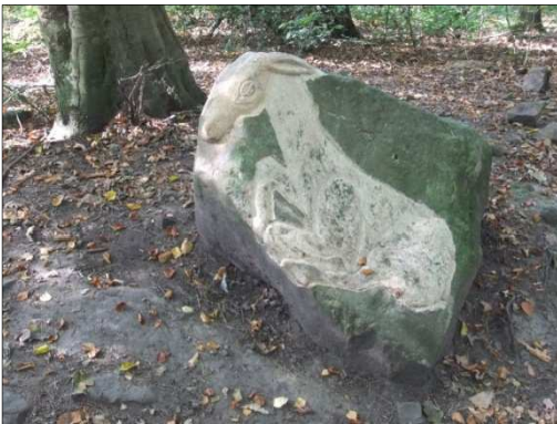
Modern carving of a buck

The walk continued down a sunken path, with examples of modern rock art on display, where a sculptor has recently carved animals (a buck, a squirrel) and words on suitably shaped boulders. Norman Alvin pointed out several trees of interest, including types of oak as well as birch and beech. Holly is ubiquitous. In the 1930s Bradford Corporation planted an area of conifers, but never felled them, giving further variety to the ecology of the wood. Clearing of trees and undergrowth underneath a line of electricity pylons suggests what the wood must have looked like when it was a 'working wood', and the owners exploited it for tall timber trees and coppiced trees over the centuries. Breaks in the trees gave views across the valley, revealing how the glaciers of the Ice Age shaped the valley.