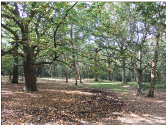
Ancient woodland, Buck Wood

Buck Wood can be classed as ancient woodland, and is included in the Survey of idle made in 1584. It is connected with the manorial corn mill that stood on the bank of the River Aire through the Buck family, who purchased the freehold of the Mill and Wood by 1620. They retained possession until 1744, when it was sold to Sir Walter Calverley, by then the Lord of the Manor, who owned Esholt Hall on the other side of the river. Sir Walter's son sold the whole of the Esholt Hall estate to the Stansfield family in 1755, and this family retained the property until 1906, when Bradford Corporation bought the whole estate in order to build a much needed sewage works for Bradford.