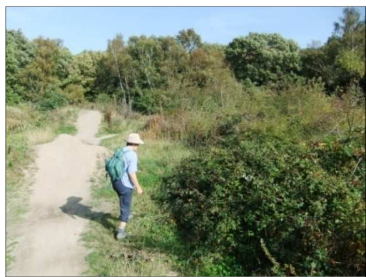
The Plateau area covered by scrub and good for butterflies

One of the earliest activities of the Corporation was to build an Open Air School just inside the wood, to provide fresh air and good food, along with education, to children whose health was affected by the poor conditions of the polluted and smoke-filled inner city of industrial Bradford. During the Second World War the school was used for military purposes, and then as a temporary base for children awaiting the construction of a new local primary school. In 1966 the buildings were damaged by fire, and were demolished and razed to the ground.